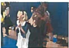
3RD GRADE PARTY FUN

"The only thing that will redeem mankind is cooperation." - Bertrand Russell