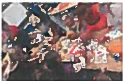
2ND GRADE PUMPKINS