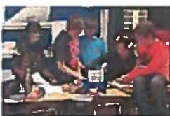
5TH GRADE PROBLEM SOLVERS