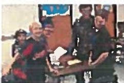
6TH GRADE SLEUTHS