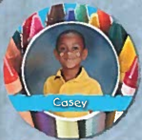
Button, Magnet, Mirror