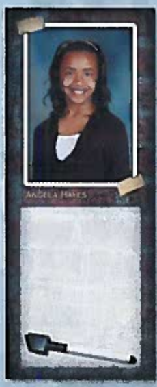
Dry Erase Locker Magnet